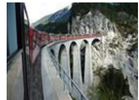
Landwasser Viaduct, Schmiten, Switzerland

We welcome your articles, letters & news items for publication in the ASCE SE Branch Newsletter.