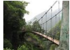
Prek Chu Bridge, Sikkim, India