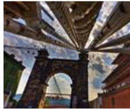
Wheeling Suspension Bridge, Wheeling, West Virginia