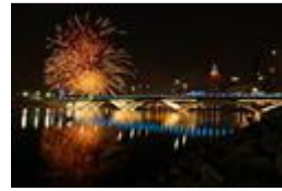
Rich Street Bridge, Columbus, Ohio