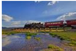
Los Pinos Trestle, Antonito, Colorado