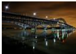
South Grand Island Bridge, Grand Island, New York