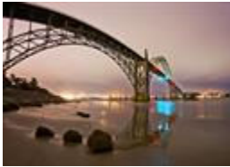
Yaquina Bay Bridge, Newport, Oregon