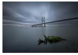
Vasco da Gama Bridge, Lisbon, Portugal