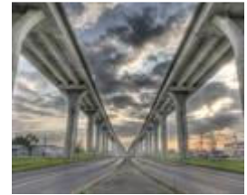
Harvey Canal Bridge, Harvey, Louisiana