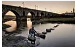
Ponte de Lima, Ponte de Lima