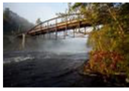
Hadley Bow Bridge, Hadley, New York