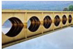
Ashopton Viaduct, Peak District National Park, U.K.